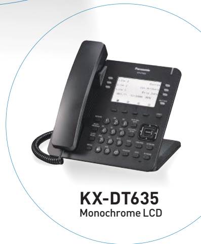
KX-DT635 Monochrome LCD

24 Flexible Function Keys (6 Keys x 4 Pages)