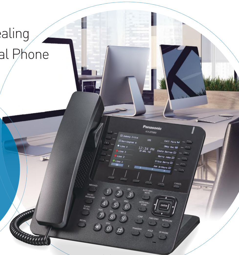
KX-DT680 Colour LCD

A digital phone that incorporates a large LCD screen with a slim design. Flexible function keys with a self-labelling feature offer the most customisation and flexibility for our customers. The large LCD screen also helps to ensure correct operation and improves usability.